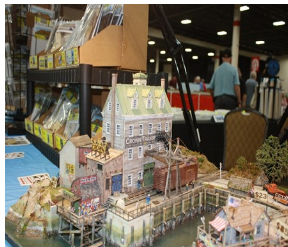
Craftsman Kit Display