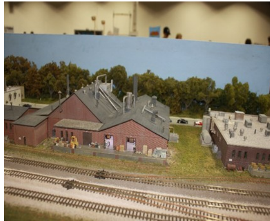
Scratch Built Factory on Modular Layout