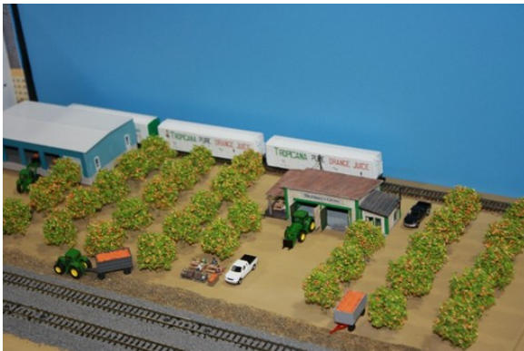
Orange Grove Sante Fe Modular Layout