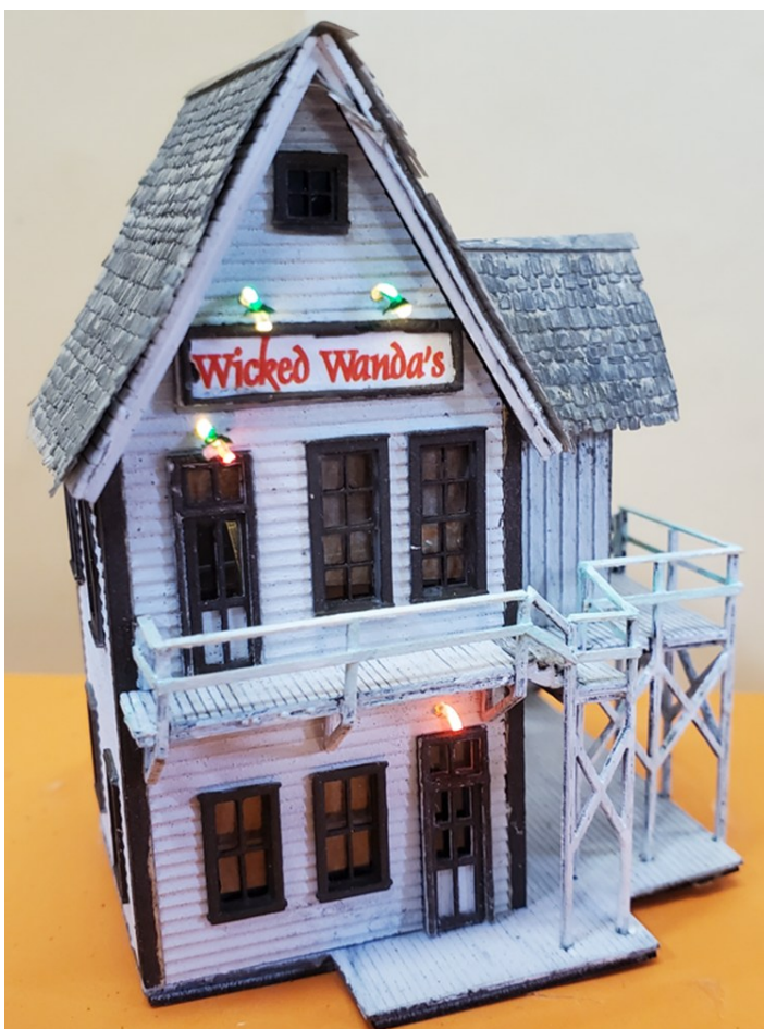
Left, Her Parsons Wicked Wanda's, (N scale)