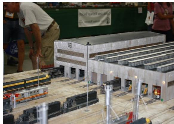
Engine Maintenance Shop Sante Fe Layout