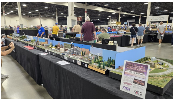
General National Train Show overview