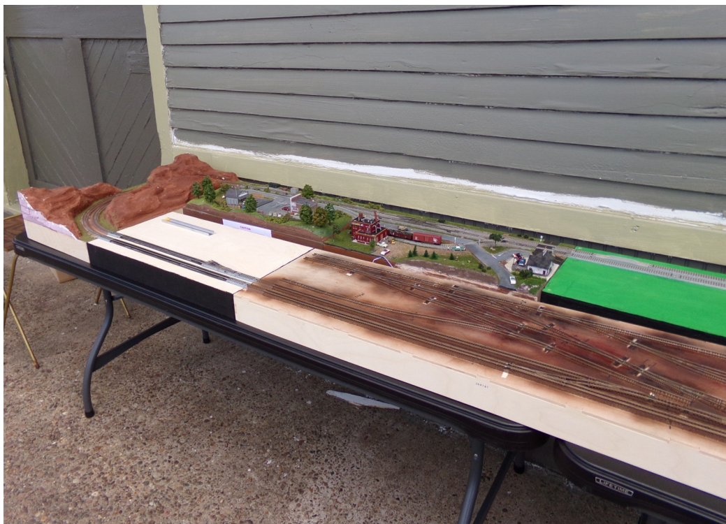
First T-TRAK layout Summer 2018

Be aware that Osborn is a Canadian company and a tariff may be applied to the purchase.