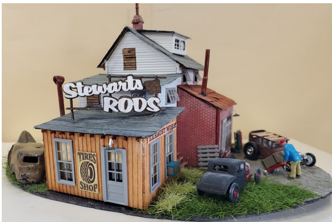
Dale Osburn – Stewarts Rods (HO scale)