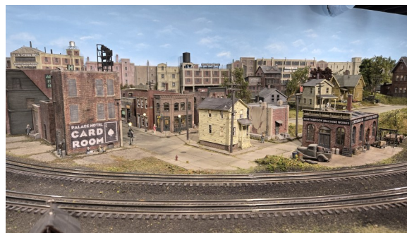
Norm Charbonneau's 3 Rail O Scale Layout