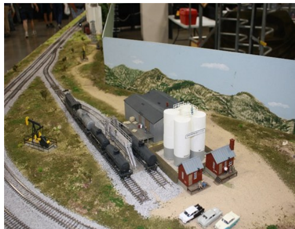
Crude Oil Collection Facility Sante Fe Layout