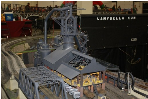
Steel Furnace Model on Modular Layout